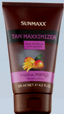
TROPICAL MANGO TANNING LOTION