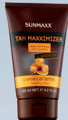
CREME CARAMEL TANNING LOTION + BRONZER