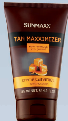
CREME CARAMEL TANNING LOTION