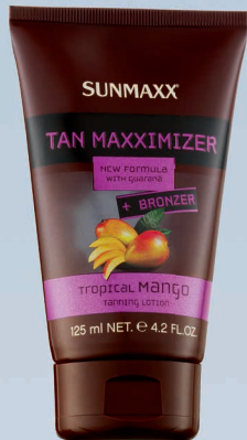
TROPICAL MANGO TANNING LOTION + BRONZER