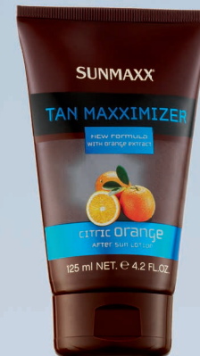
CITRIC ORANGE AFTER SUN LOTION